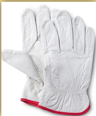
Marks Work Warehouse Women's Manhandler Gloves