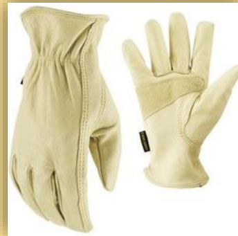
Home Depot Firm Grip Full Grain Pigskin Leather Gloves