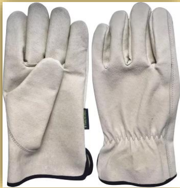
Canadian Tire Men's Pigskin Leather Work Gloves